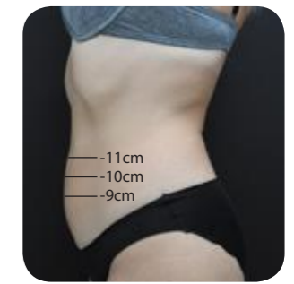
After 3 Months