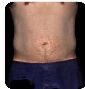
After 1 Month