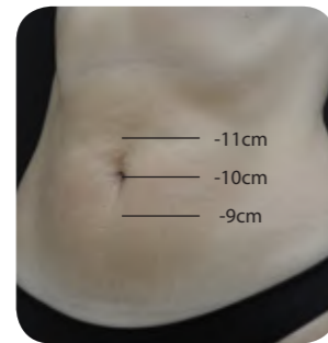
After 1 week